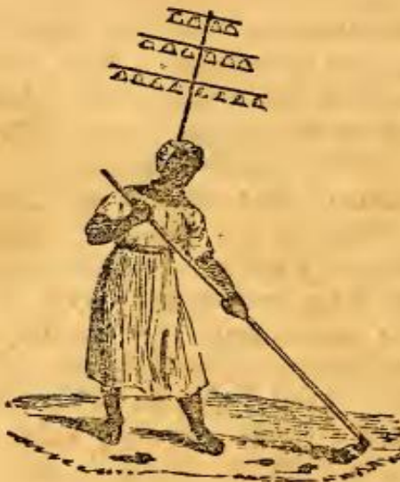
A WOMAN WITH IRON HORNS AND BELLS ON, TO KEEP HER FROM RUNNING AWAY.